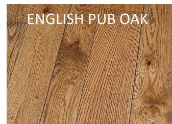
ENGLISH PUB OAK