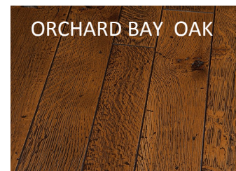
ORCHARD BAY OAK