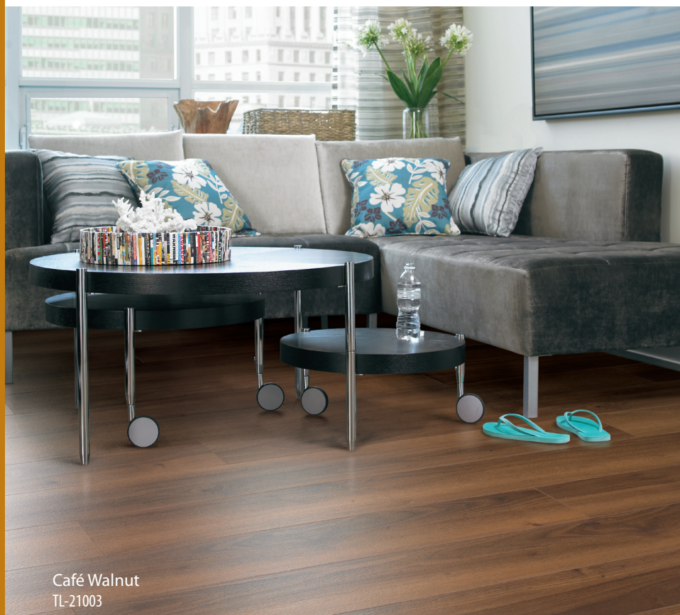
Café Walnut TL-21003

The contemporary and inspired look of nature's exquisite woods.